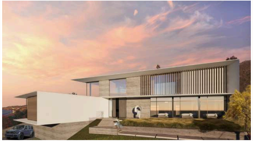
WEST FACADE — GOLDEN HOUR