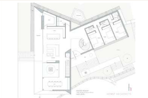
MID LEVEL · 3,017.63 SF HABITABLE