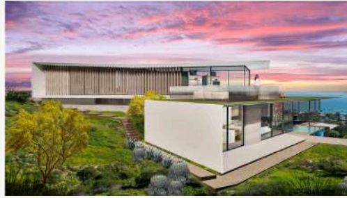
ENTRY COURT — CANYON BACKDROP