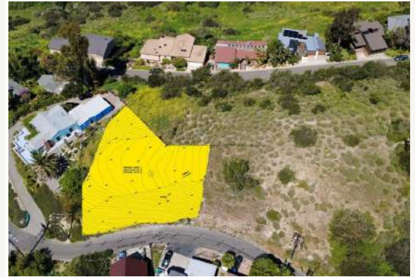
PARCEL OVERLAY — 12,363 SQ FT · LOT A