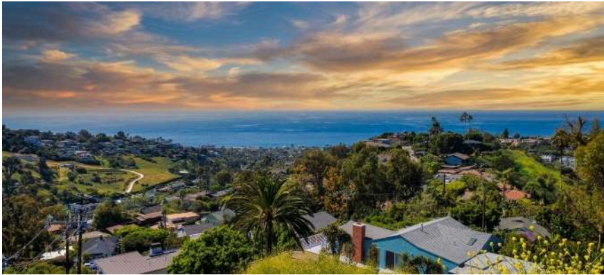
ACTUAL VIEW FROM SITE — PACIFIC OCEAN · CATALINA ISLAND · LAGUNA CANYON