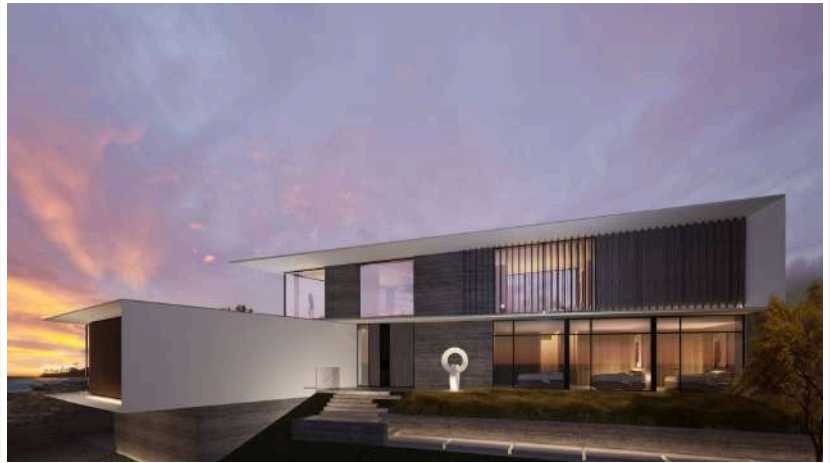
EVENING — INTERIOR ILLUMINATION