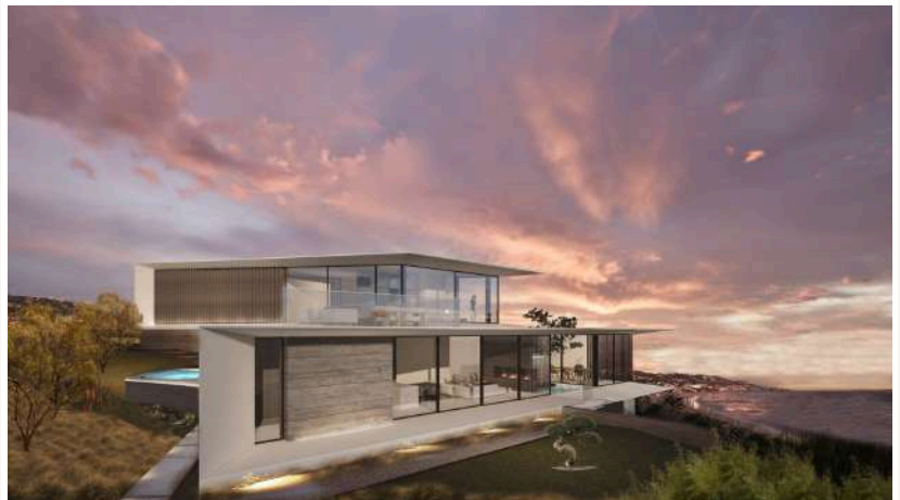
OCEAN SIDE — 170° PANORAMA