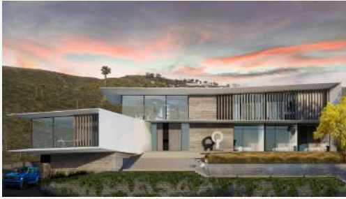
CANYON SIDE — HILLSIDE SETTING